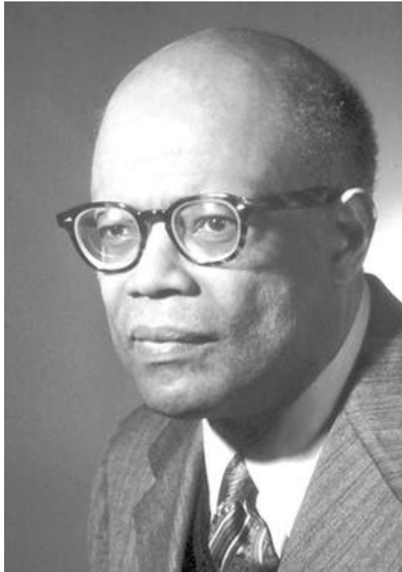
Arthur Lewis (1948) UK and Manchester's First Black Professor